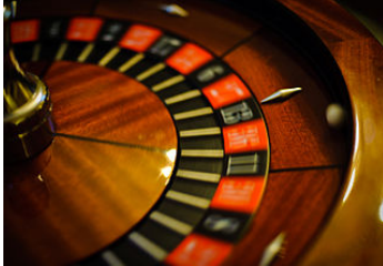
Gambling and Risk

Prerequisites: Vv216 or Vv256 or Vv286 and the preceding calculus courses.