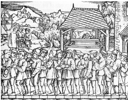
Statistics in the Middle Ages